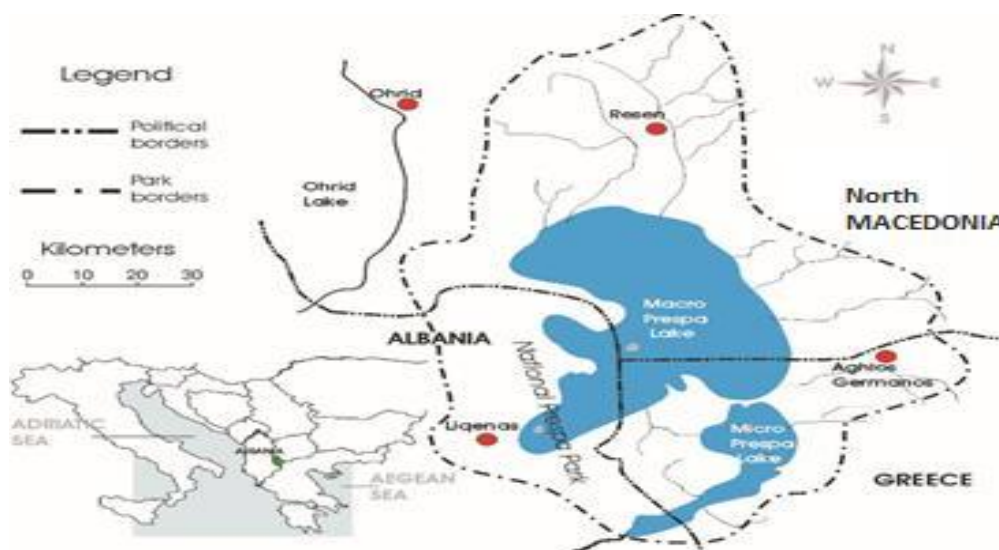
Figure 1. Prespa Park region

The three countries that share the Prespa Park basin, have designated parks and/or protected areas within their own territories. For Fremuth and Shumka (2013), they are the strongest tourism assets at present.