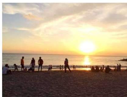
Figure 1. Panorama Sunset Loang Baloq beach

So if the potential is certainly huge because it is very close to reaching the city center, the potential for its development is more of a push into a recreational and sports tourism destination (interview, 2021).