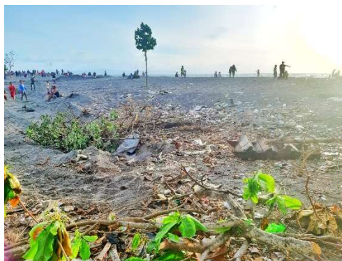
Figure 2. Condition of garbage at Loang Baloq beach

The lack of it in the toilet is a bit dirty; the same garbage is scattered (interview, 2021)