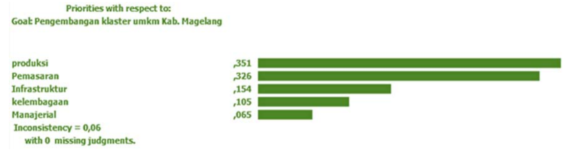
Figure 1. The Main Aspects Analysis. Within SMALL MEDIUM ENTERPRISES Cluster Development of Tourism In Borobudur, Magelang, According To Key Person